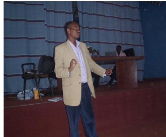
Zone Culture and Tourism Department