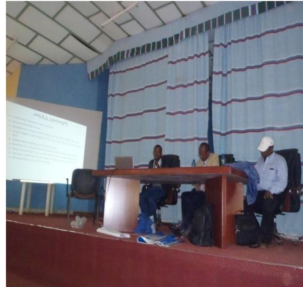
Part of Group Discussions and Presentations