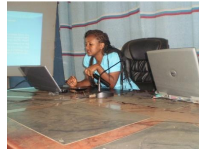
Zone Culture and Tourism Department