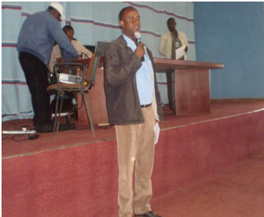
Zone Administration Representative